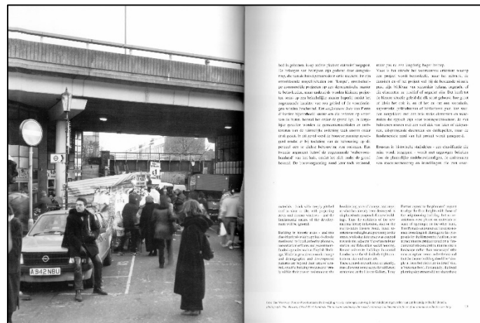
In search of public space, asphalt romanticism