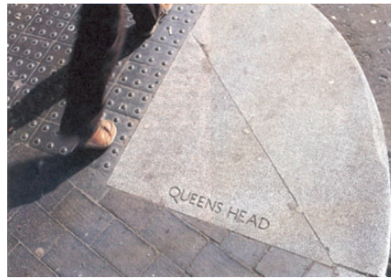
Lettering Burrough High Street

colour and size. The stainless steel sans-serif lettering and various shades of grey terrazzo tiles did not contrast significantly with all the existing asphalt and concrete slabs, but introduced a second order of 'luxury' materials in the existing gritty pallet of materials. This design should be understood as an update to the Without Rhetoric approach of Alison and Peter Smithson. The project was not thrust upon anyone who did not want to experience it.