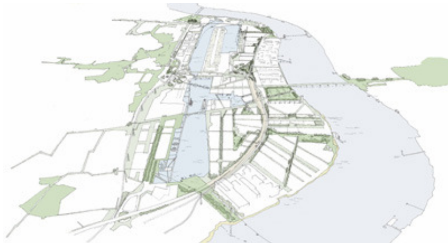
Urban analysis East