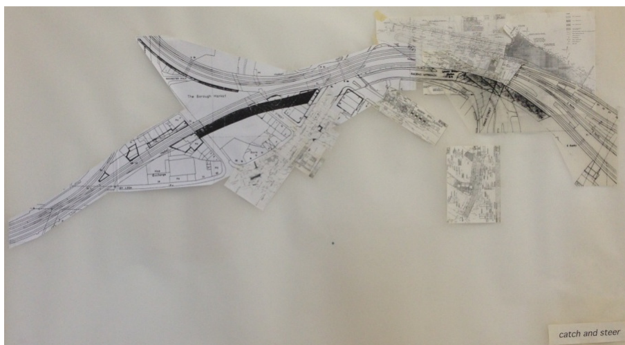
Sketch Burrough High Street, Catch and Steer

After the Second World War, an extensive spatial planning system was established in London and the United Kingdom, as throughout Western Europe, with the main aim of rebuilding the country. This system remained in operation until Margaret Thatcher took the helm in the 1980s. Under her regime, the planning system was rapidly dismantled. From then on, the government stepped back to play an evaluative role, focusing on core competences in the areas of the environment and infrastructure. Central and local government authorities in the UK adopted a more administrative approach when it came to building projects and urban regeneration, with private parties being the ones who actually took the initiative. London provides a very good example of what happens when Government takes a step backwards. In the context of similar international trends at the moment, London is a useful tenet to explore.