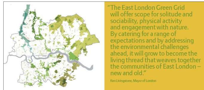
East London Green Grid Primer

Brearley's name is not included in the document. However, various cultural experts in the field each in their own way contributed essays and photos reflecting their fascination with the green structure of London, in addition to the maps. The publication therefore did not ostensibly argue for the positive appreciation of the Green Belt and for this space to be integrated in the urban functioning of the metropolis of London, as previously sought by East. Such arguments seemed to have become political reality with the Primer, as Mayor Ken Livingstone wrote in large letters on the back cover: 'The East London Green Grid will offer scope for solitude and sociability, physical activity and engagement with nature. By catering for a range of expectations and by addressing the environmental challenges ahead, it will grow to become the living thread that weaves together the communities of East London – old and new.'