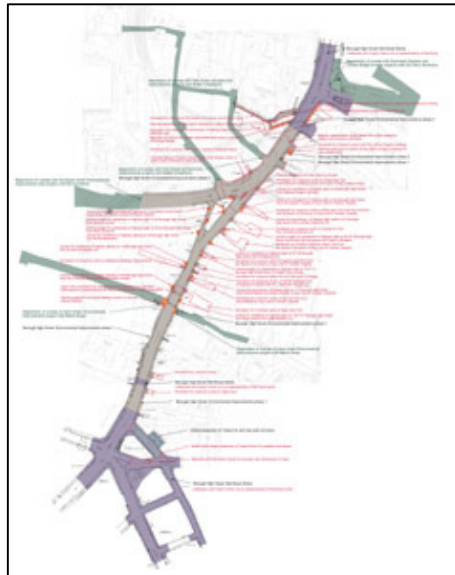
Map Burrough High Street

The project map did not have any images. The public realm of the planned area, Borough High Street, a few traffic intersections and junctions with side roads, was shown in a grid. An extensive series of captions indicated, for each situation, exactly what processes had to be executed in order to implement the project. The map showed what permits had to be applied for from the public works and transport departments, to install traffic lights, replace pavements, incorporate zebra crossings and red lights, set up street signs, where negotiations were needed in order to get private parties on board and where coordination was needed with the designers of neighbouring regeneration projects.